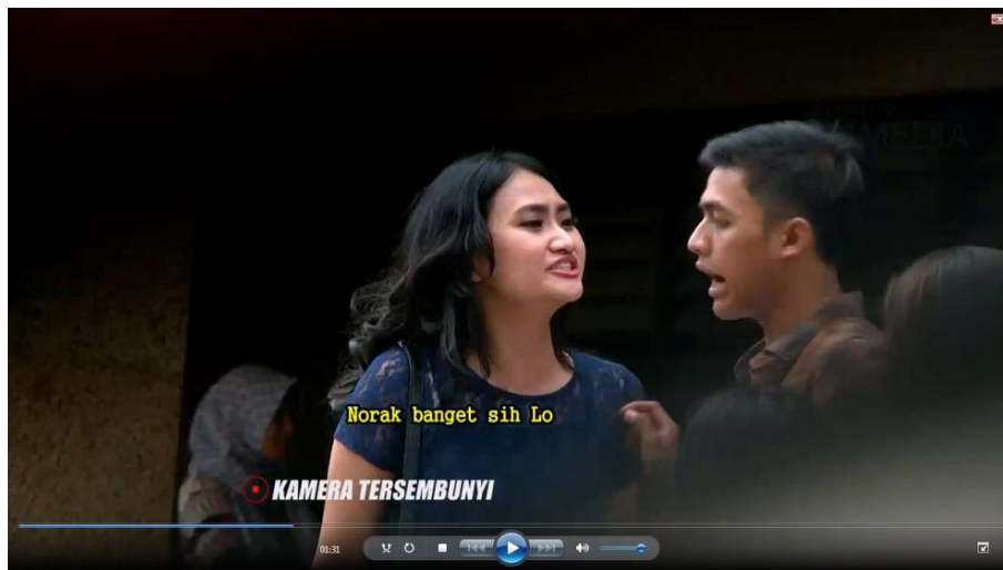
Sixteenth picture: Tiwi angry with Rama.