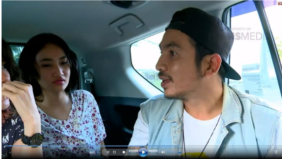
Thirteenth picture : Komo angry with the two clients